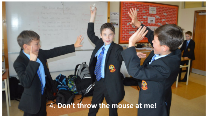
4. Don't throw the mouse at me!