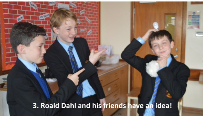
3. Roald Dahl and his friends have an idea!