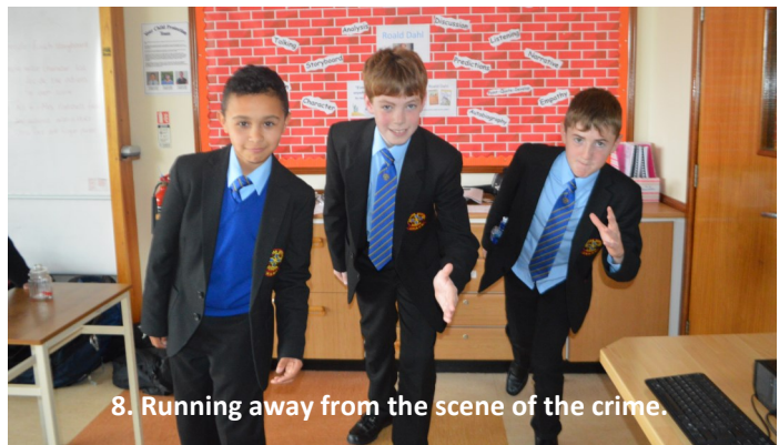
8. Running away from the scene of the crime.