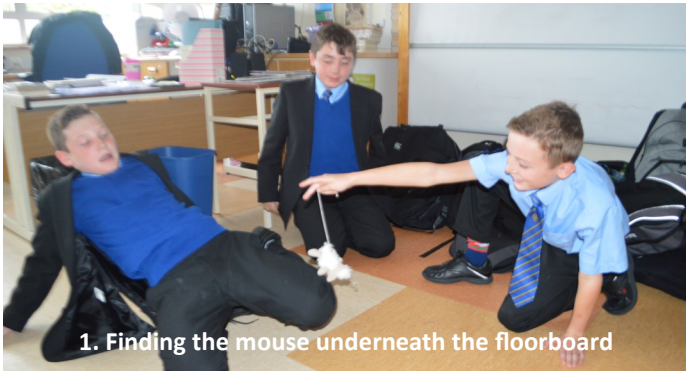
1. Finding the mouse underneath the floorboard