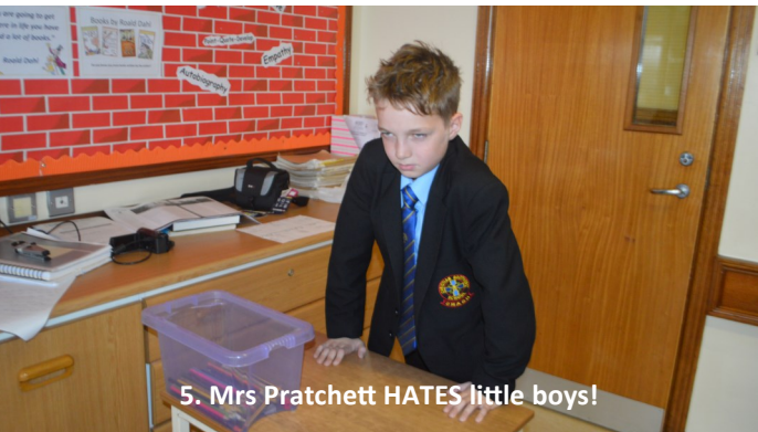
5. Mrs Pratchett HATES little boys!