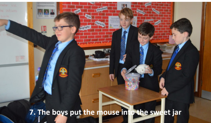
7. The boys put the mouse into the sweet jar