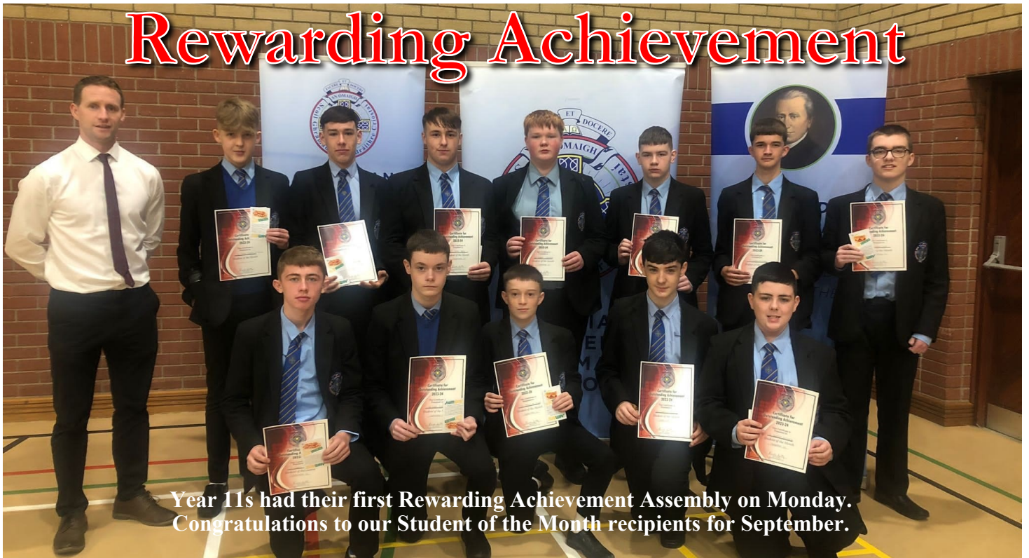
Year 11s had their first Rewarding Achievement Assembly on Monday. Congratulations to our Student of the Month recipients for September.