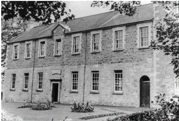
The Old School at Mount St. Columba

On January 14th 1861 the school opened its doors for the first time with 121 boys. On May 7th the school was placed under the patronage of Saint Columba.